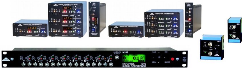
Figure 2: Metra's IEPE Measurement Amplifiers

Many measuring instruments have an inbuilt IEPE compatible input with an integrated constant current supply and a coupling capacitor. Metra's power supply unit M28 or the measurement amplifiers M32, M72 and M208 are also suitable for constant power supply and signal output coupling (Figure 2);