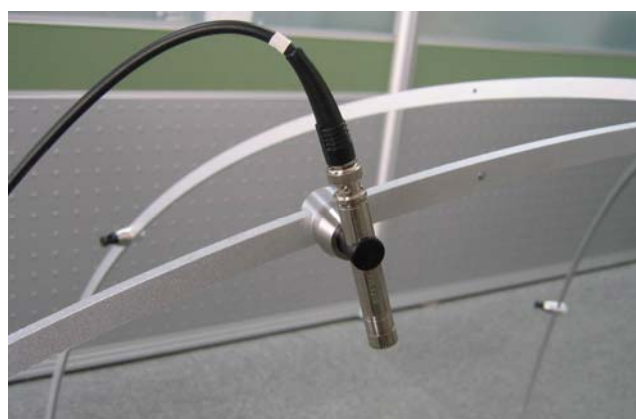
Figure 1: Microphone Mounting for MF720